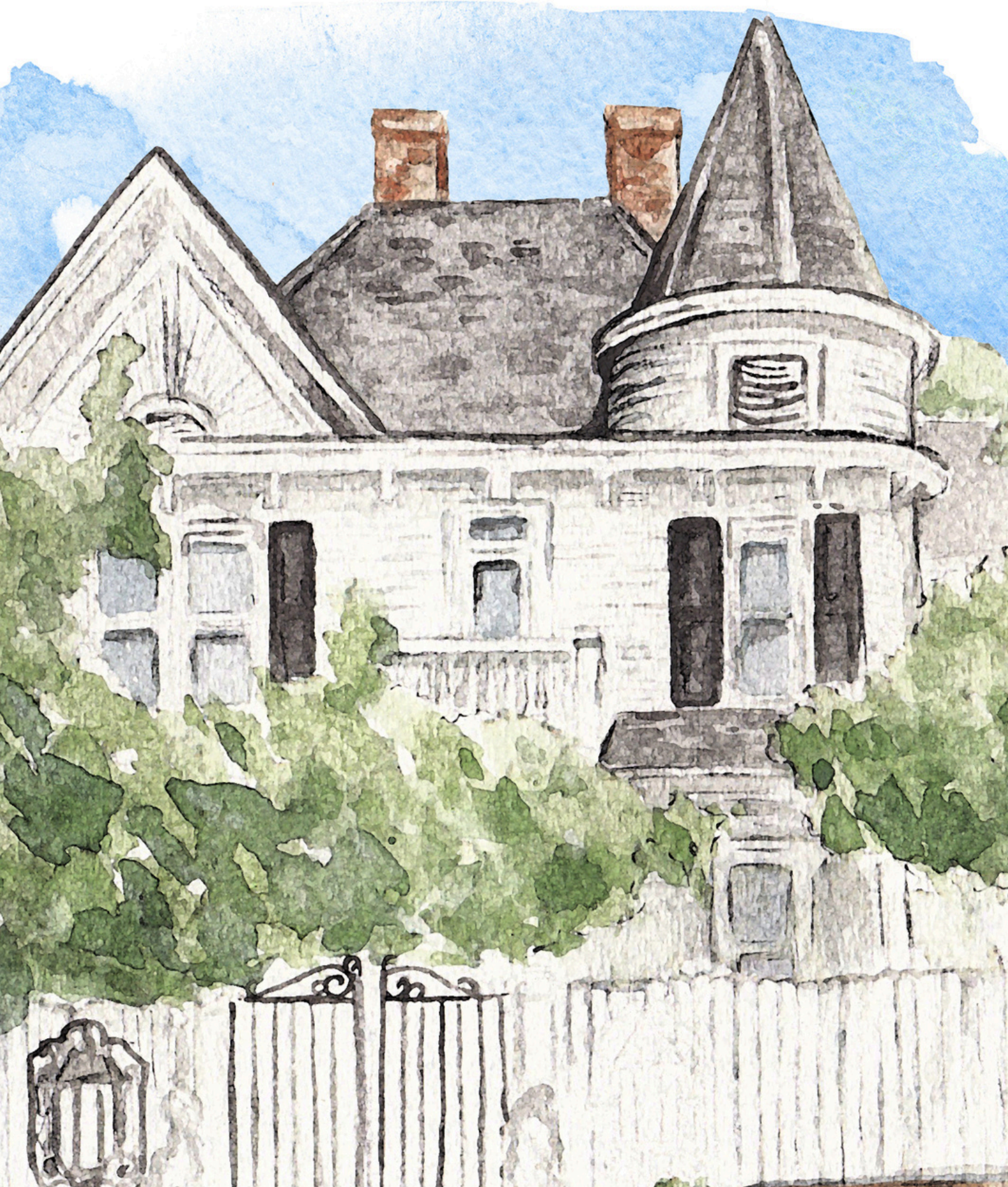
Stanley House LUXURY INN - GRAND EVENTS