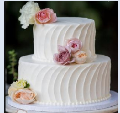
ANGLED RIGID DESIGN