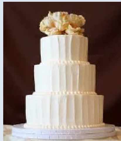
3 TIER SERVES 75-150 PEOPLE