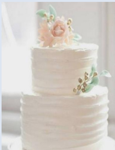
2 TIER SERVES 25-70 PEOPLE

DEPENDING ON YOUR GUEST COUNT, YOUR CAKE WILL EITHER BE 2 TIERS OR 3 TIERS. ELOPEMENTS WILL HAVE A SMALLER 2 TIER CAKE WITH CHOICE OF CHOCOLATE OR VANILLA BASE